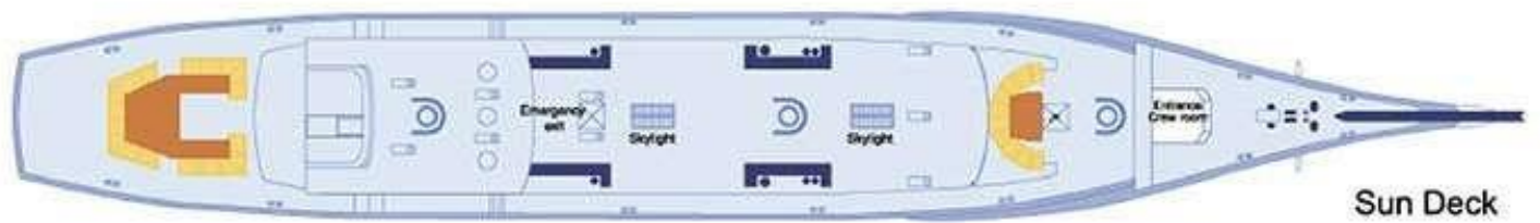
S/S Mary Anne